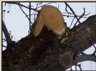
Stub Cut & Tear Cut

Minnesota's 1st Accredited Treecare Company