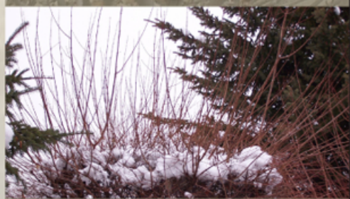
Sprouting due to shearing