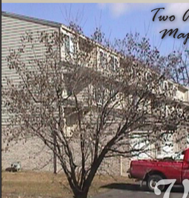
Naturally Pruned Maple